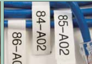
Cable ID Flag Labels