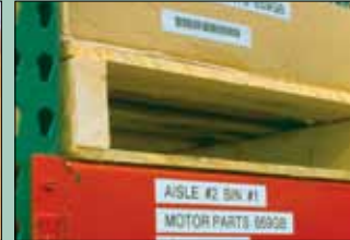
Warehouse and Storage