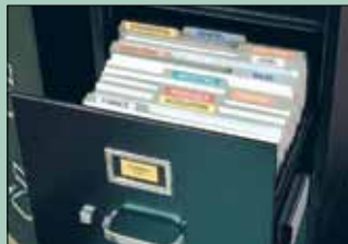
Files and Records