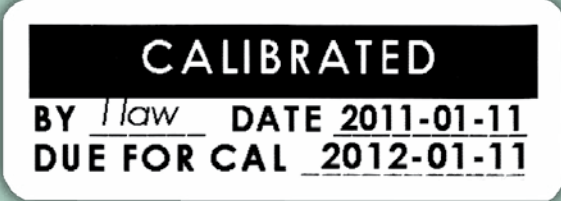
Custom Calibration Labels