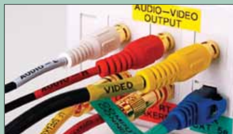
TV and Cable