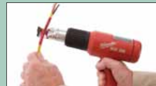
Heat Shrink Tube ID Prints on 5 Heat Shrink Tube Sizes in 6 Color Combinations. Prints on 6 Labeling Tape Sizes 1/6" (4mm), 1/4" (6mm), 3/8" (9mm), 1/2" (12mm), 3/4" (18mm) and 1" (24mm). Prints on one Self-Laminating Wire Wrap Tape.