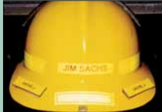
Police and Fire