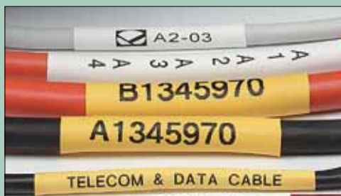
Wire and Cable Identification