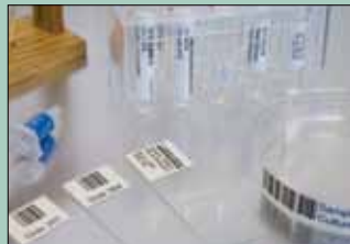
Laboratory and Medical Identification