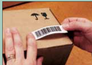
Bar Code Labels